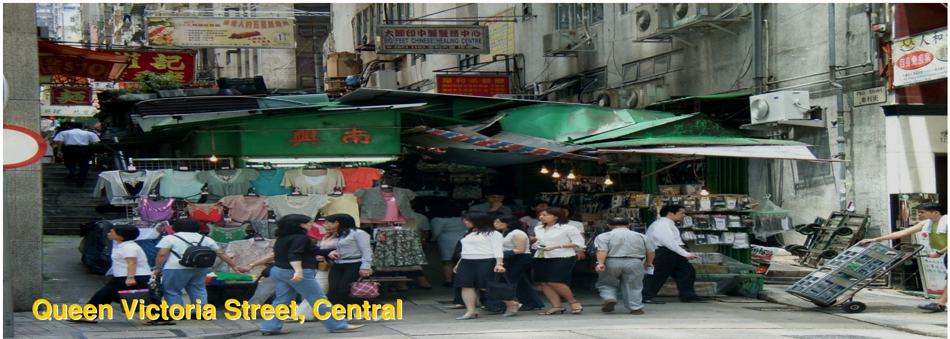
Queen Victoria Street, Central