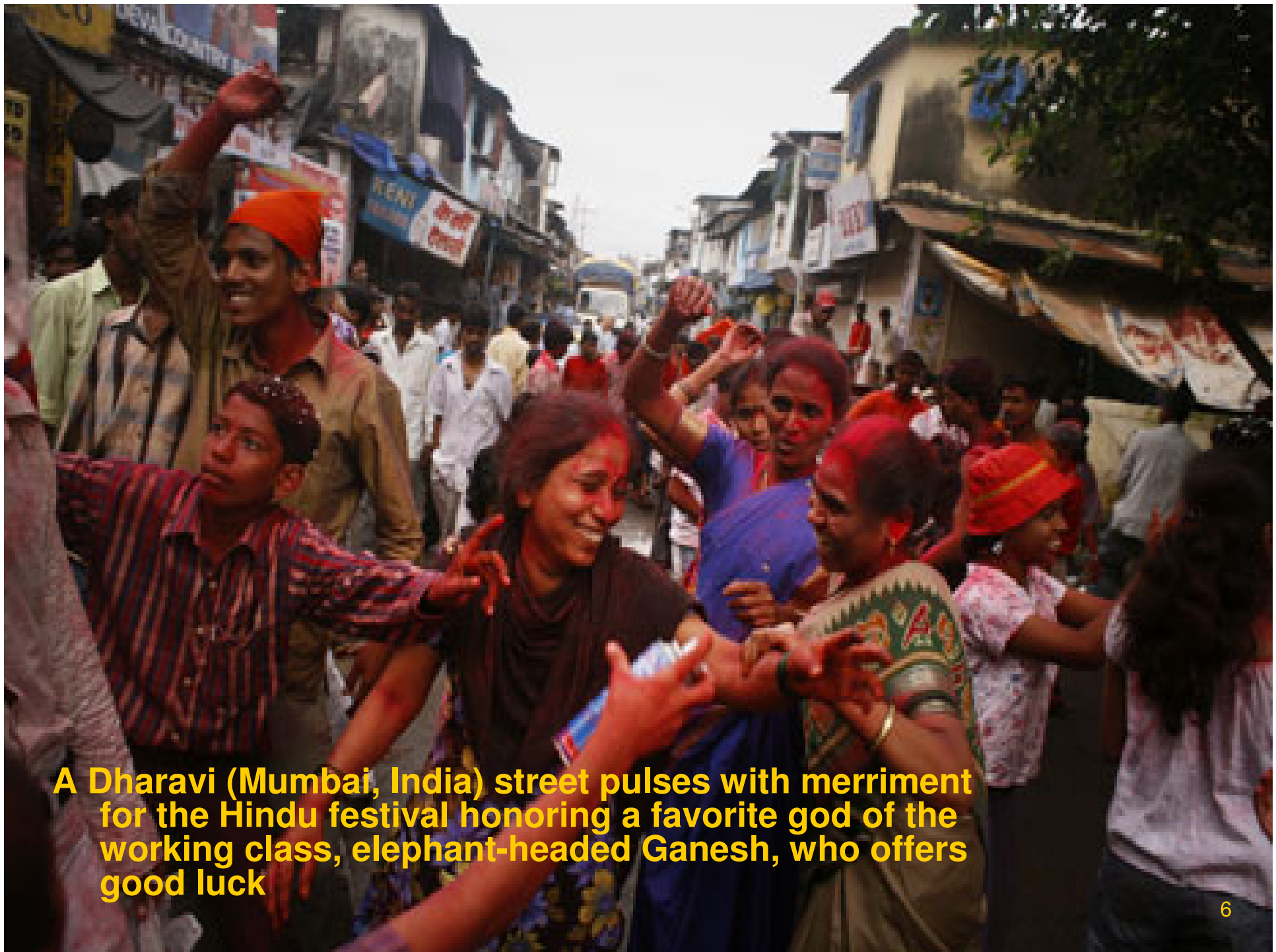
A Dharavi (Mumbai, India) street pulses with merriment for the Hindu festival honoring a favorite god of the working class, elephant-headed Ganesh, who offers good luck