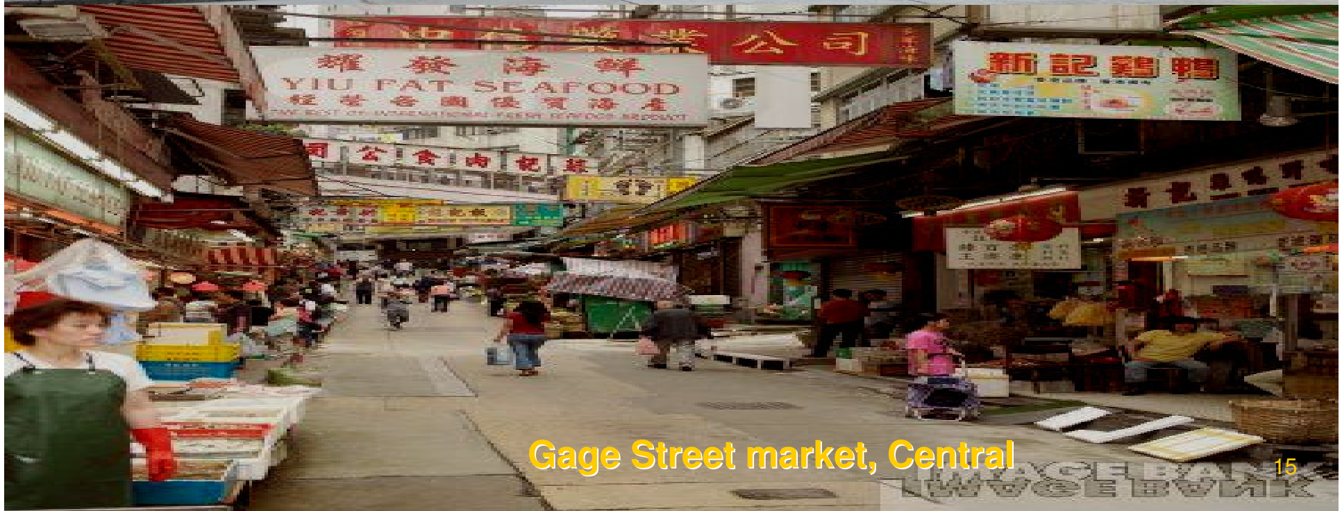
Gage Street market, Central